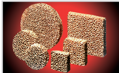
Selection of STELEX ZR filters