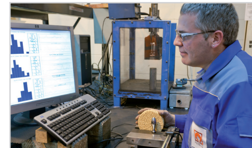
Statistical process control