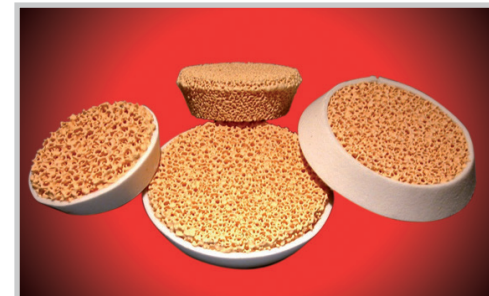
STELEX ZR filters for investment casting