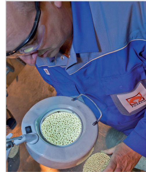
Visual quality control