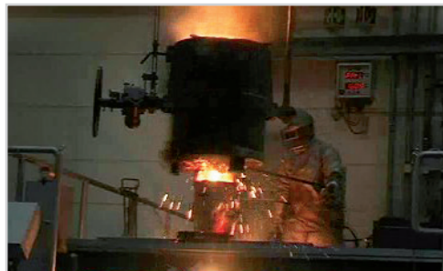
Impingement testing unit

Our engineers and product managers work in partnership with our customers to help them improve productivity, process control, casting quality and the working environment.