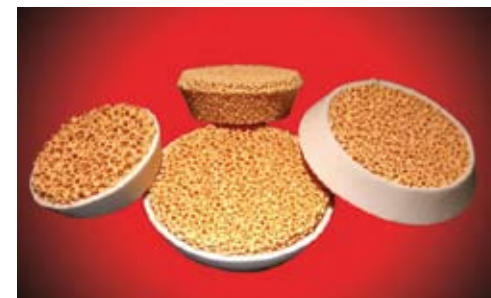
STELEX ZR filters for investment casting