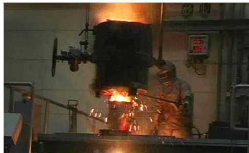
Impingement testing unit

Our engineers and product managers work in partnership with our customers to help them improve productivity, process control, casting quality and the working environment.