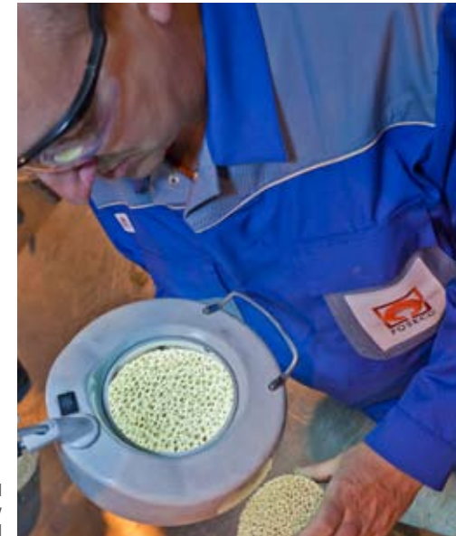
Visual quality control