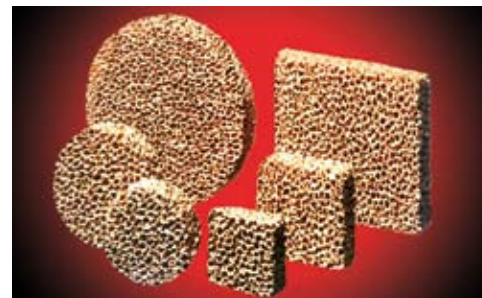
Selection of STELEX ZR filters