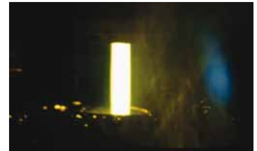
Metal stream from a cross bore nozzle