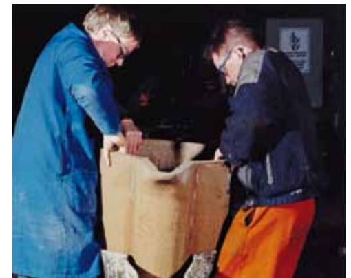
Fitting a KALTEK shank