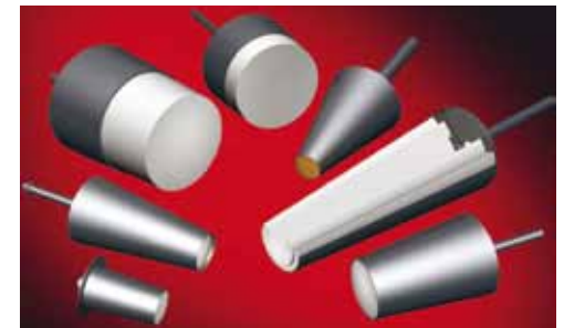
Gas diffusers available in a range of shapes