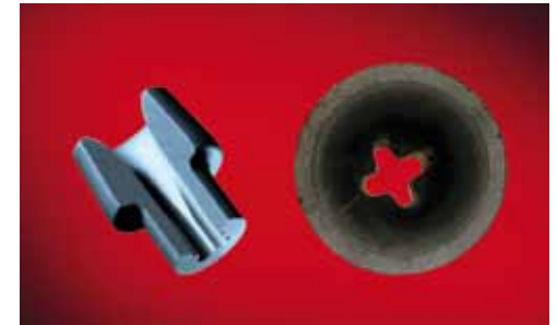
VAPEX cross bore nozzles

To facilitate the optimum purging process, gas diffusers are available in a range of materials and shapes.