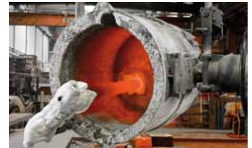
Bottom pour ladle ready for use