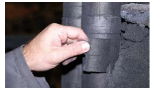
Less disposal costs