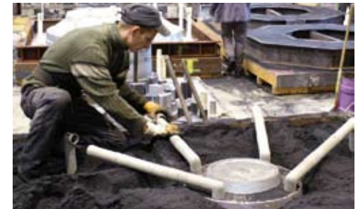
Easy to assemble