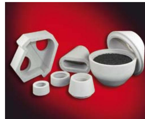
HOLLOTEX C2-FH components

HOLLOTEX C2-FH and HOLLOTEX EG Runners can be combined simply and easily in the building of gating systems.