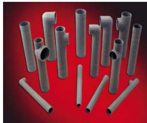
HOLLOTEX EG Runner components

Such systems are much easier to handle than a conventional ceramic one and they are also less prone to breakage. The product range is based to three main shapes: tubes, L- and T-pieces.