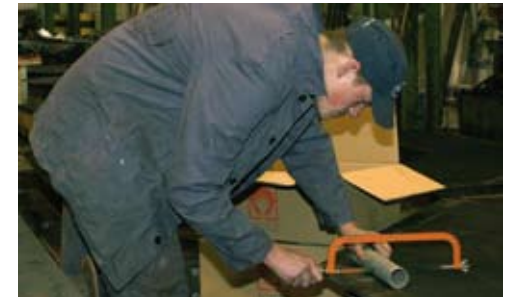
Easy to cut