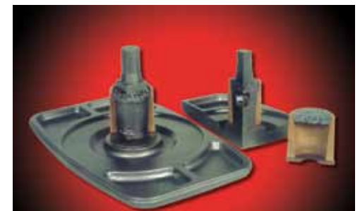
Buffer plate KALPUR direct pour unit application