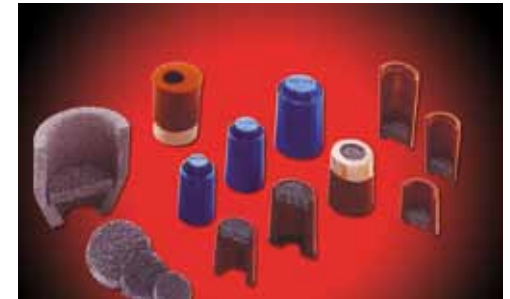
KALPUR direct pour product range