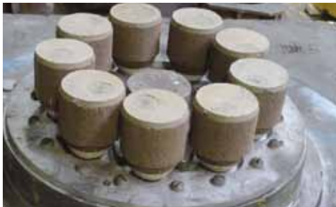
KALMINEX sleeves on a pattern plate