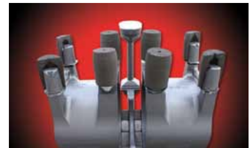
Elevator housing with FEDEX K sleeves