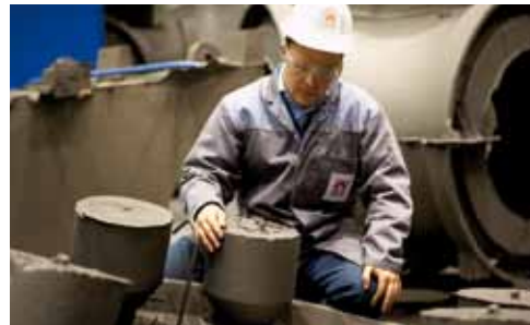
Wide ranging methoding expertise