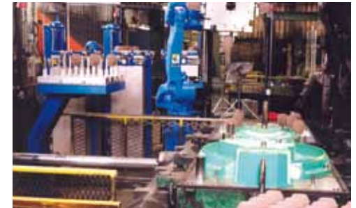
Robotic application of FEDEX sleeves

In addition, very small neck contact areas can be achieved, minimising machining requirements.