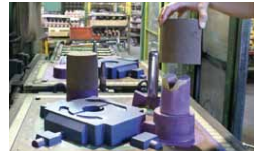
Application of KALMINEX insert sleeves