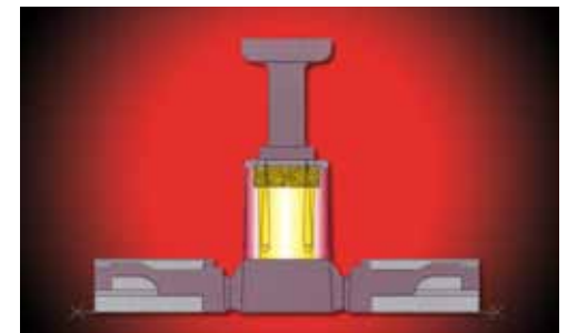
Simulation of KALPUR direct pour unit greensand application