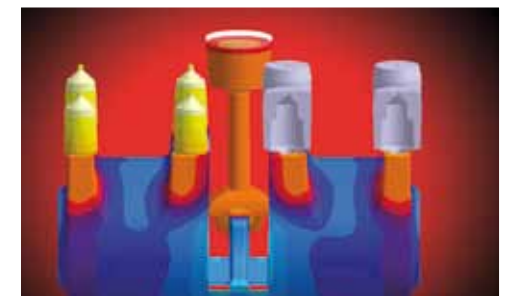
Simulation of elevator housing