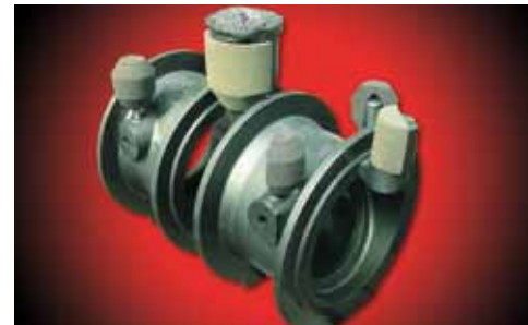
KALPUR*, FEEDEX and KALMINEX application on a 100 kg sg iron casting