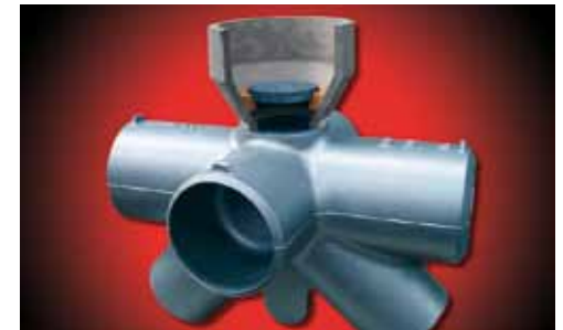
Berlin Olympic Stadium node casting