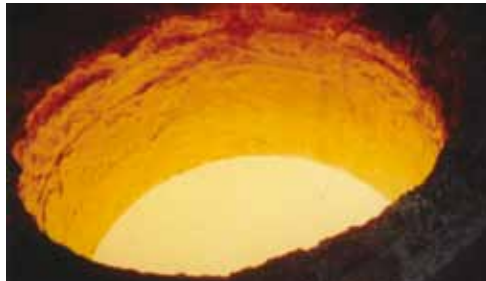
The furnace is ready for the second tap. Note the clean metal and lining surface.

The stirring action of induction melting that ensures a more homogenous microstructure, distributes the slag material throughout the melt and increases the risk of slag related defects. Slag build up on the furnace walls increases melting times and energy costs. Slag removal is an expensive and aggressive process and risks damaging the refractory lining.