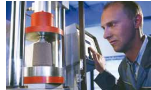
The newly developed sleeve and unique core technology is designed to withstand the highest moulding pressures