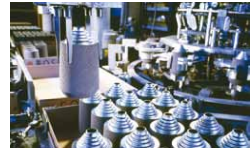
FEEDEX K sleeves are manufactured using highly sophisticated production lines to ensure consistent performance

*FOSECO, the Logo and FEEDEX are trade marks of the Vesuvius Group, registered in certain countries, used under licence. All rights reserved. No part of this publication may be reproduced, stored in a retrieval system of any nature or transmitted in any form or by any means, including photocopying and recording, without the written permission of the copyright holder or as expressly permitted by law. Applications for permission shall be made to the publisher at the address mentioned.