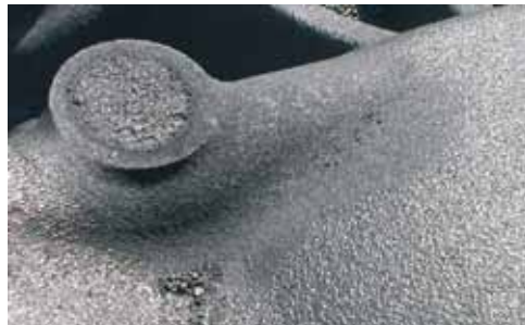
The result is a feeder profile that requires little or no cleaning