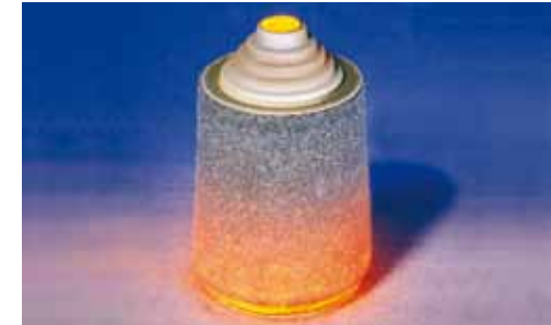
FEEDEX K sleeves are specially formulated to give optimum feed performance