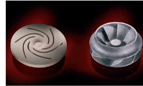
Impeller for high-efficiency centrifugal pumps

Binder bridges in the ECOLOTEC process are more elastic than in many other core-making processes. Hence casting defects related to sand expansion, such as veining, are significantly suppressed or eliminated and anti-veining additives are usually not required to obtain sound castings.